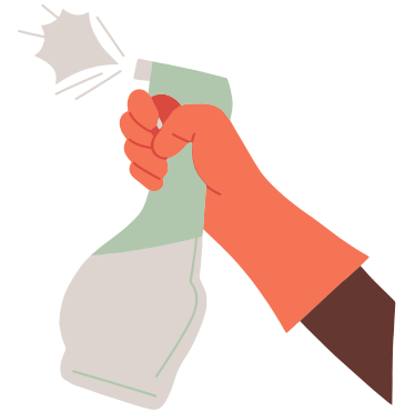
Appendix E of the Health Care Plan (OCFS-LDSS-7020)

https://ocfs.ny.gov/main/childcare/assets/May%202013%20Understanding%20Recent%20Changes%20to%20Bleach.pdf