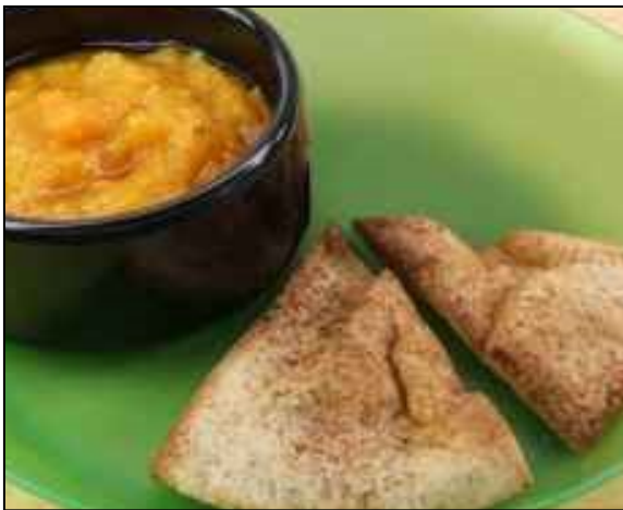
Source: Team Nutrition: Toasted Pita Wedges and Fruit Dip using canned apricots.

You can use any summer fruit to try this quick and easy recipe!